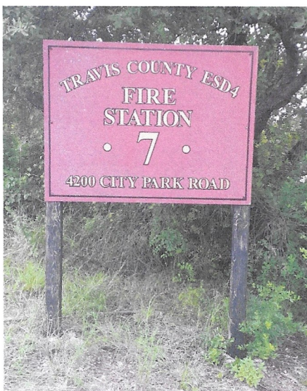
Existing sign: 3' tall x 4' wide